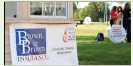
Thanks to Community Champion Underwriter Brown & Brown Insurance for their continued support of our annual tournament.